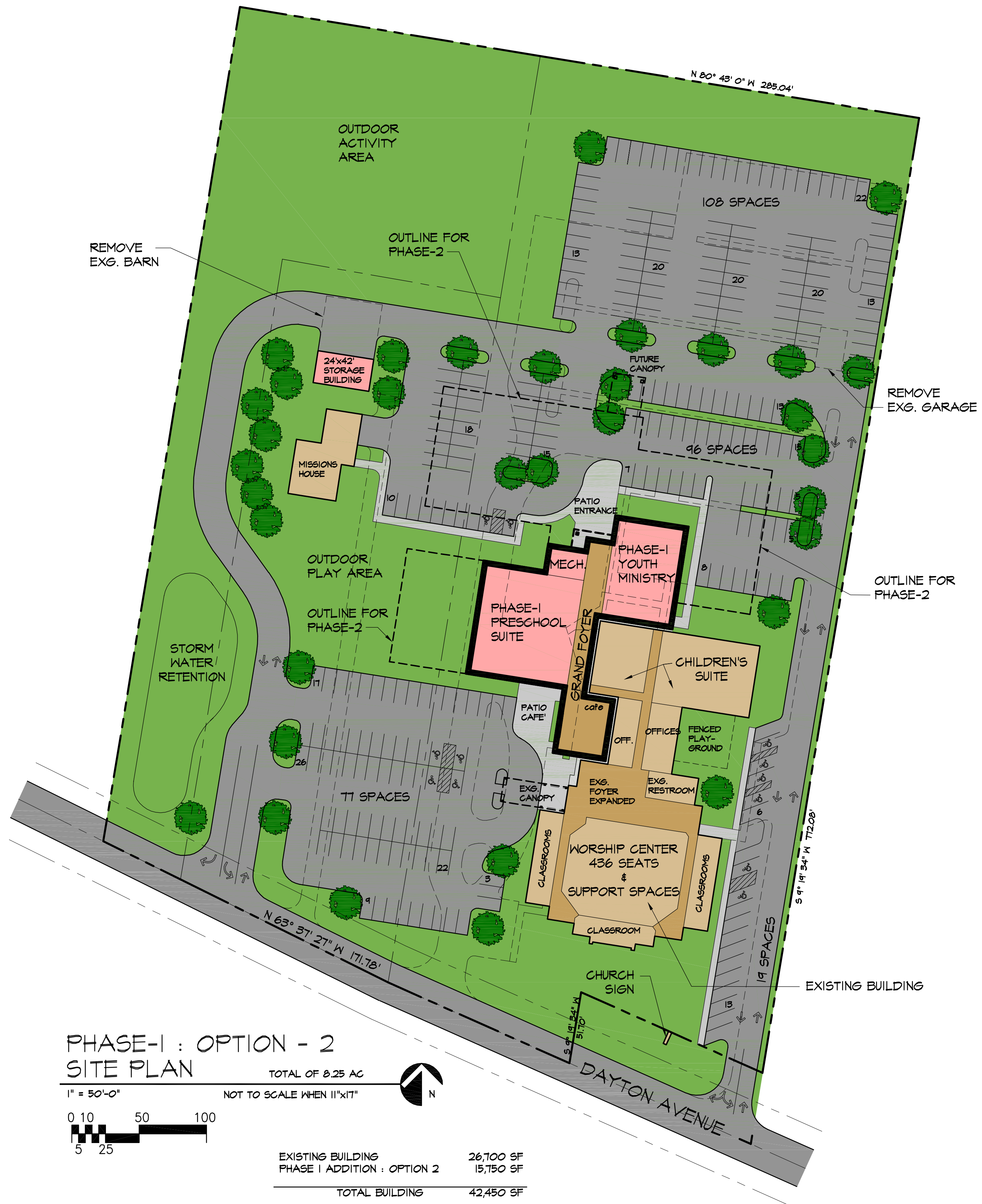
PHASE-I : OPTION - 2 SITE PLAN TOTAL OF 0.25 AC 1" = 50'-0" NOT TO SCALE WHEN 11"x17"