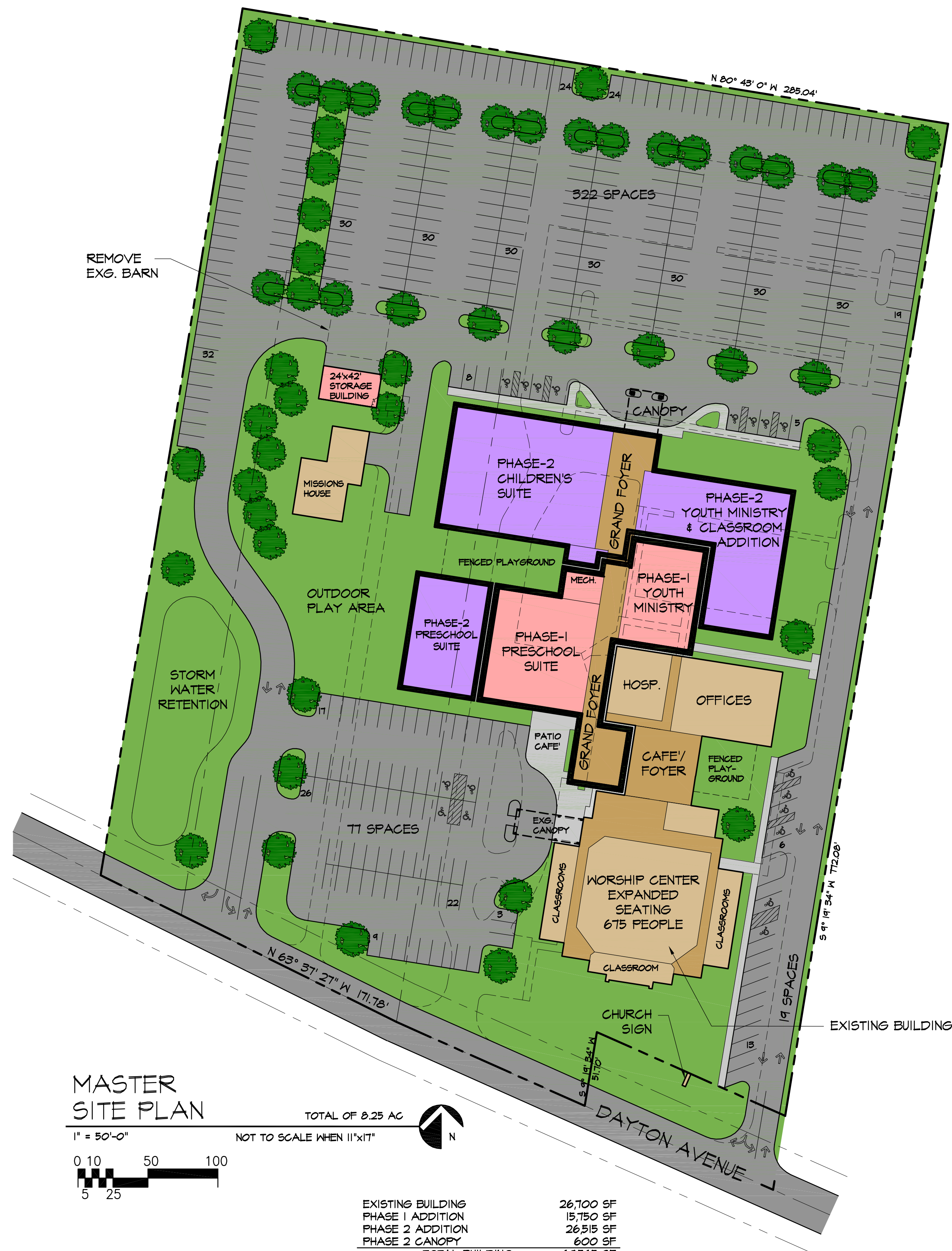
MASTER SITE PLAN TOTAL OF 0.25 AC 1" = 50'-0" NOT TO SCALE WHEN 11"x17"